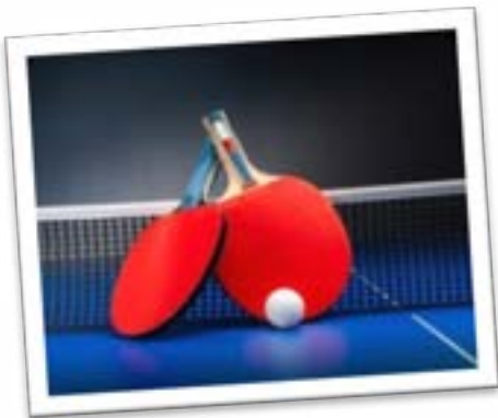
Table Tennis Group

We meet at 10.30am on the third Monday of the month. If you'd like to come along, contact the Groups Coordinator directly or via the u3a website.