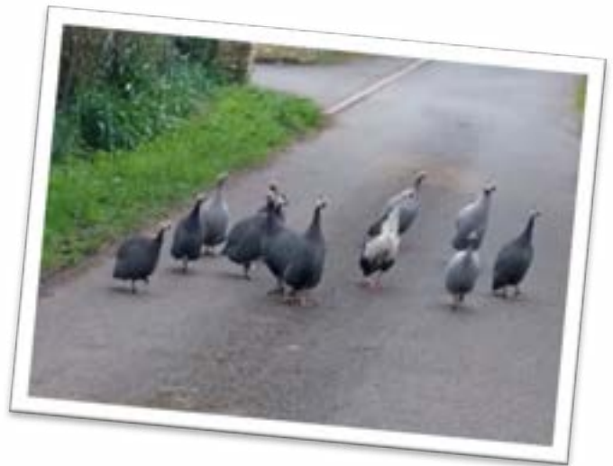
Guard guinea fowl?